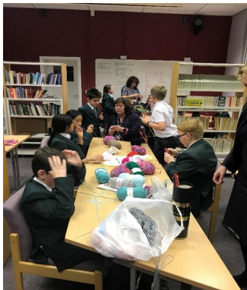
Wool War 3: Y6 pupils try to find their colour.