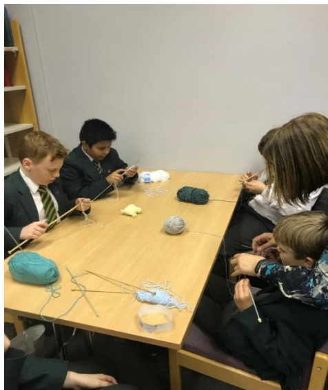
Boys of Y6 going at it hammer and tongs. Well, needle and needle.

Now here's a club you might not have expected to be on the school activity list! A textile skill which has really piqued the boys' and girls' interest. As you can see from the intense frowns of concentration, the whole process has perhaps consumed some of these students to such a degree, that whilst they are capable of knitting, there isn't too much nattering going on at the same time!